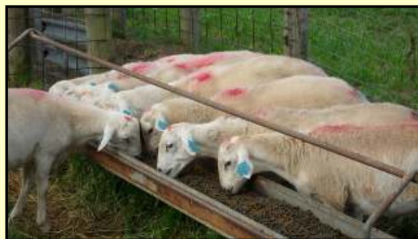
Lambs on SL study in Arkansas

In the first experiment, while fecal oocyst and (worm) egg counts were similar, the control lambs had higher fecal (dag) scores than the SL-fed lambs, suggesting more signs of coccidiosis. Oocyst counts declined more rapidly in amprolium-treated lambs. In experiment 2, fecal oocyst counts decreased after weaning in the SL-fed lambs and remained lower. Post-weaning coccidiosis treatment was required in 33% of the control lambs, but none of the SL-fed lambs. In the third experiment, oocyst and egg counts were