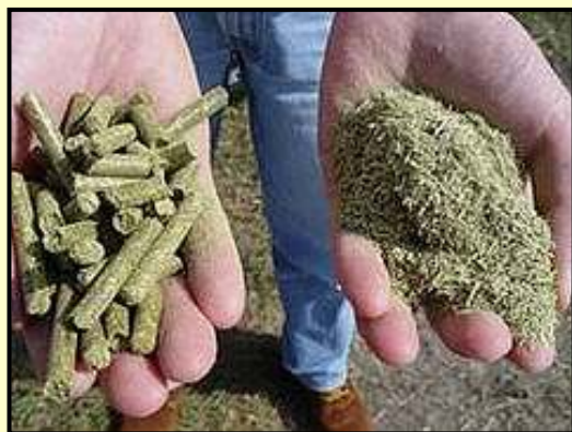
SL Pellets and leaf meal

The results of three experiments were published last year in Veterinary Parasitology . In the first experiment, weaned lambs were fed either alfalfa (control) or SL pellets, with or without amprolium (Corid®) added to their drinking water. In the second experiment, lambs were fed a control or SL creep supplement before and after weaning. In the third experiment, weaned lambs were fed a control or SL supplement and inoculated with 50,000 sporulated oocysts.