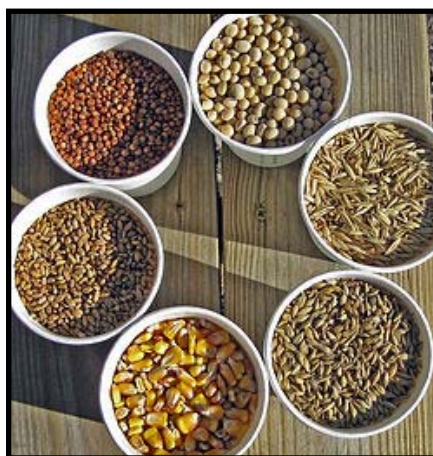
(Cereal grains are low in calcium and high in phosphorus)

Calcium is generally not regarded as a toxic element, because excess calcium is excreted in the feces. According to the National Research Council, the maximum dietary level of calcium is 1.5 percent. The greatest concern for phosphorus may be related to the ratio of calcium to phosphorus. High phosphorus diets predispose sheep and goats, especially males, to urinary calculi (kidney stones). Urinary calculi occurs mostly with high concentrate diets and can be prevented by maintaining a proper ratio of Ca to P in the diet, usually between 1:1 and 2:1. Excess dietary phosphorus also represents the greatest potential for environmental pollution.