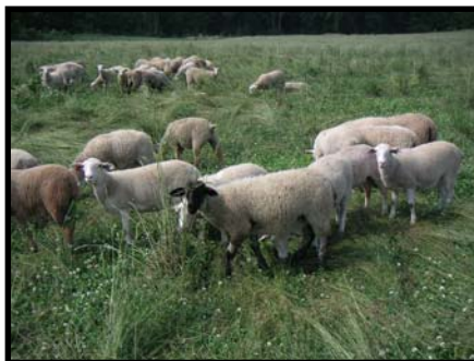
(Hair X Wool Lambs)

In a feed lot finishing system, the gain and carcass merit of Texels-sired lambs is equivalent to Suffolk-sired lambs. Neither terminal sire impacted the parasite resistance of the crossbred rams. Either breed makes a