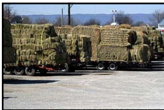
(Legume hays are a good source)

Milk and milk replacers, of animal origin, are rich in calcium and well-absorbed by young ruminants. The calcium in soy-based replacers is less absorbed. Milk is an important source of phosphorus for the young. Colostrum is richer in phosphorus than the main milk.