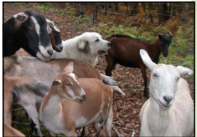
(A member of the herd)

To learn more, go to http://workingdogliabilityinsurance.com/ .