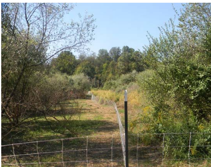
DelDot site with treatment paddock on the left and control paddock on the right. Goats were effective in managing groundcover vegetation (grasses and weeds) and the invasive shrub Japanese Honeysuckle.

The results from the DelDOT site indicated that the goats were only effective in managing the growth of Japanese