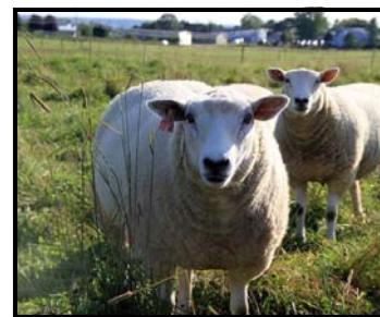
Texel ewes in Nova Scotia